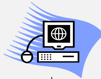
Analyze the document

Sends report to Receiver with similarity